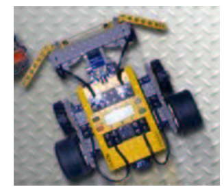
Fig. 3. Example of an obstacle avoiding robot

As discussed above, we assume that the robot is informed by a synchronous component about sensor events. Therefore, we cannot specify the possible events in general but these depend on the connected sensors, application relevant sensor values etc. We only assume that there always exists a process (wait n) which terminates n milliseconds after its first activation (in principle, this can be described by sending and waiting for appropriate messages from the synchronous subsystem).