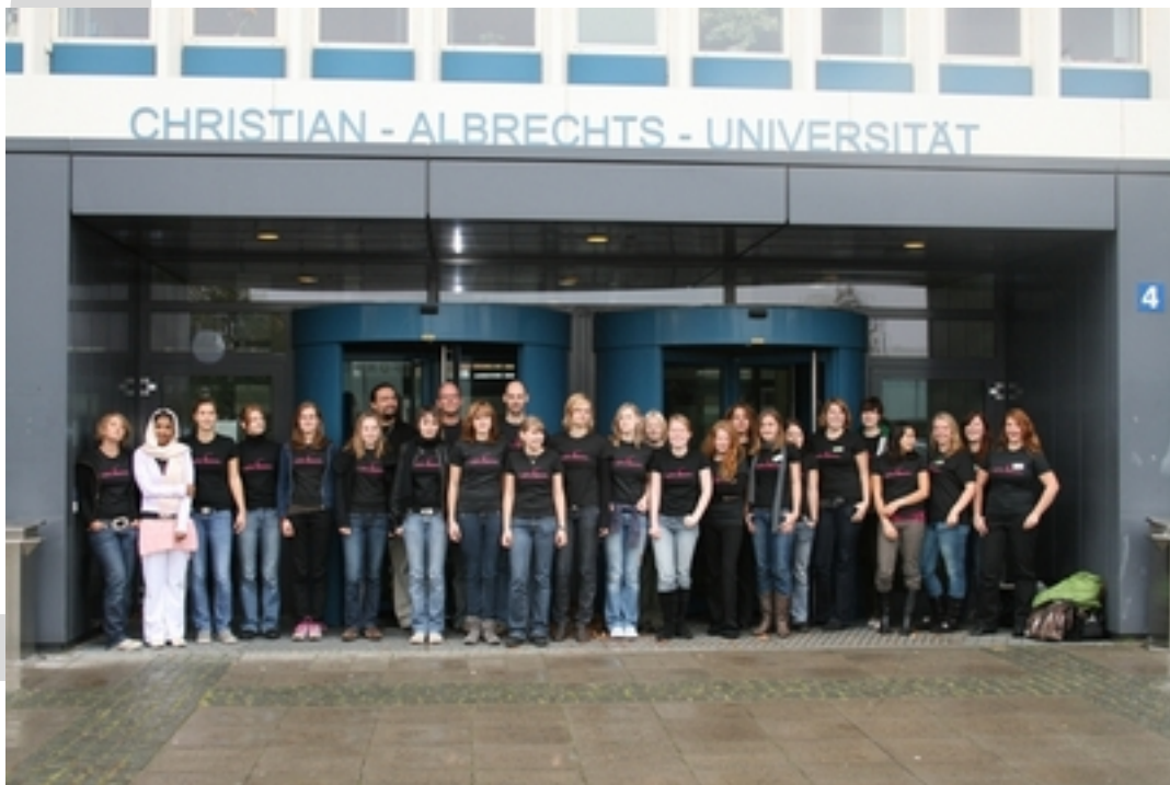
Fig. 2: Participants of the "Schnupperstudium Informatik"